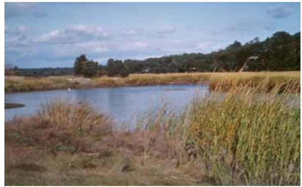
Stony Brook Wetlands- The Discovery Cruise will take you through a wetlands preserve to see the coves where the rumrunners offloaded their illegal whiskey to their customers.

Pull Lady Lizzie alongside Stony Brook Harbor where you can take a 1 ½ hour cruise on board The Ward Melville Heritage Organization's "Discovery" wetlands cruise. The 35-passenger pontoon boat will take you through the heart of the wetlands and the naturalist on board will guide you through history, birds and marine life of the area, and the coves where the bootleggers would anchor undetected! Cottage owners at West Meadow learned never to question things that went "bump" at night. From time to time they would find several cases of Scotch or Champagne left on their doorstep, probably thrown hastily by a rumrunner making a get-away.